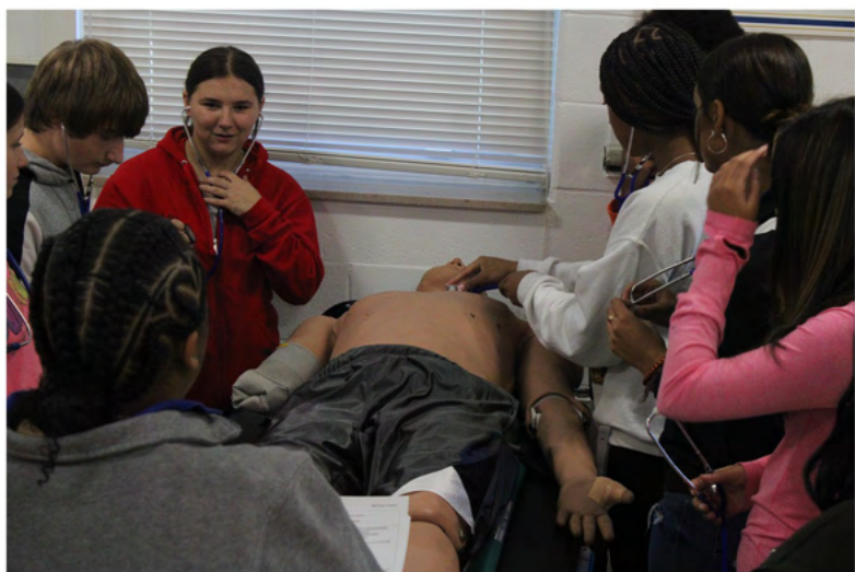
Students looking for a heartbeat in METI Man