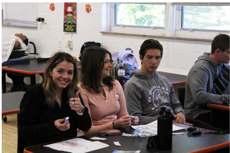
All smiles before learning their blood type!